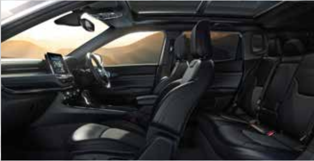
G7X9 - Black Cloth/Vinyl Seats with Black Interior (Standard Night Eagle)