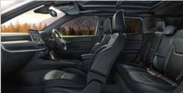
ALX9B - Black Leather Seats with Black Interior and Grey Stitching (Standard - S-Limited)