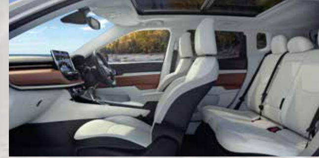
ALXA - Ski Grey Leather Seats with Ski Grey & Brown Interior and Grey Stitching (Optional - Limited)