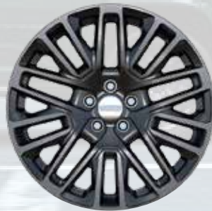
WCH - 19-inch Hyper Black Alloy Wheels (Standard on S-Limited)