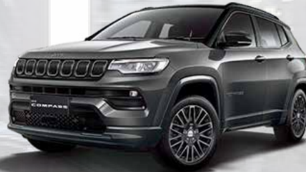
PNM - Grey Magnesio (Option)