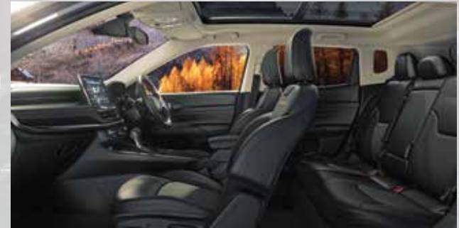
TLXC - Black Leather Seats with Black Interior and Red Stitching (Standard - Trailhawk)