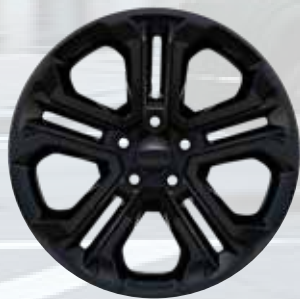
WBA - 18-inch Black Alloy Wheels (Standard on Night Eagle)

Option (O) Standard (S) Not Available (-) Must Have (m/h) Packaged With (p/w) Not Available With (NAW)