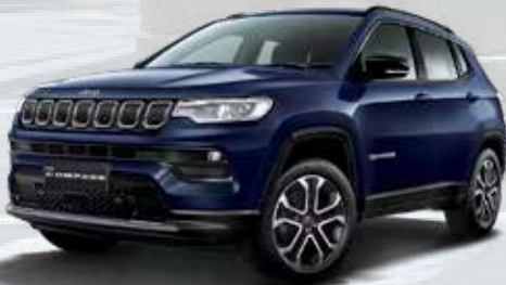
PHK - Galaxy Blue (Option)