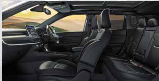
DLX9 - Black Leather Ventiladed Seats with Black Interior and Grey Stitching (Option - S-Limited)