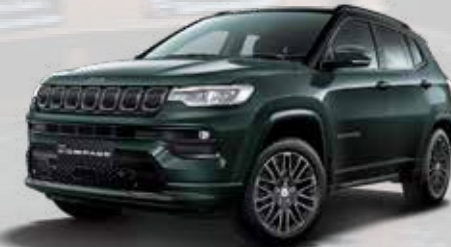
PGT - Hunter Green (Option)