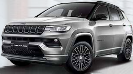
PAF - Minimal Grey (Option)