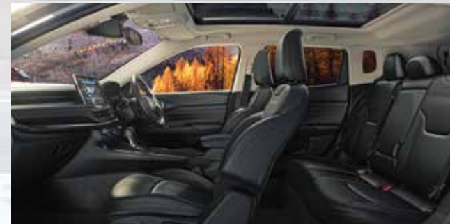
BLXC - Black Leather Ventiladed Seats with Black Interior and Red Stitching (Option - Trailhawk)