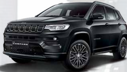
PXR - Brilliant Black (Option)