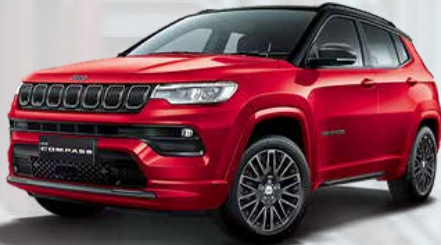
PRX - Colorado Red (Standard)