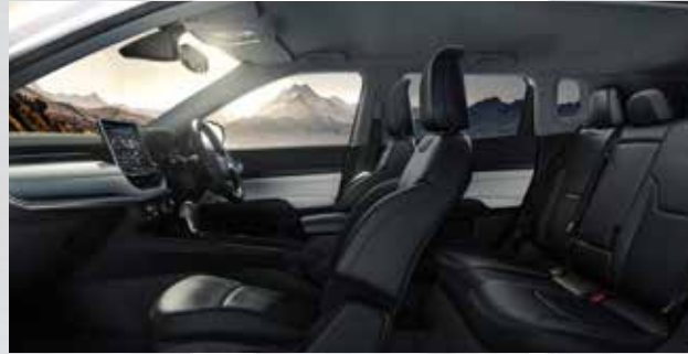
ALX9A - Black Leather Seats with Black and Ski Grey Interior and Grey Stitching (Standard - Limited)