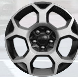
WFP - 17-inch Off-Road Alloy Wheels (Standard on Trailhawk)