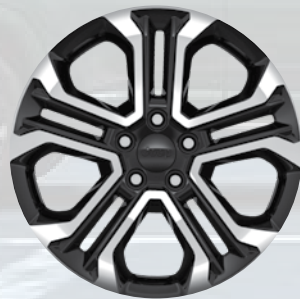
WP6 - 18-inch Alloy Wheels (Standard on Limited)