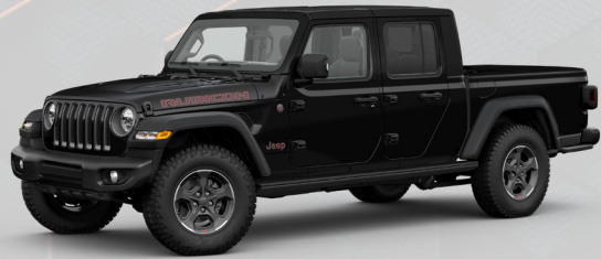
PX8 - Black (Standard)