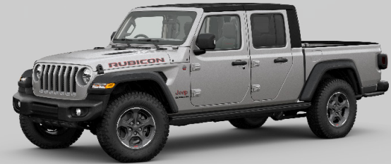
PSE - Silver Zynith (Option)