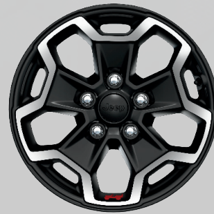
WFN - 17-Inch Polished Black Alloy Wheels (Option on Rubicon)