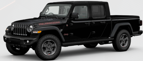
PX8 - Black (Standard)