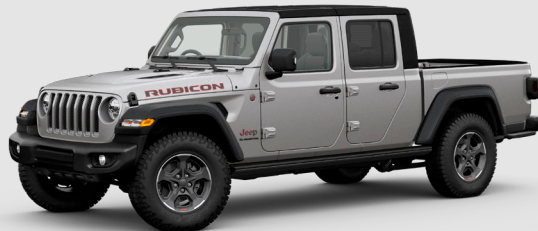
PSE - Silver Zynith (Option)