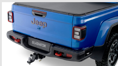
Tow Bar Kit