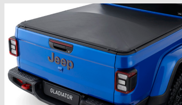
Side Window Air Deflector