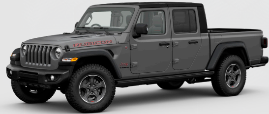
PDN - Sting Grey (Option)