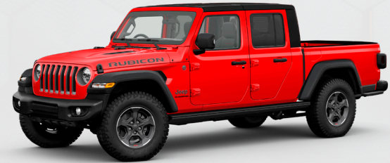
PRC - Firecracker Red (Option)