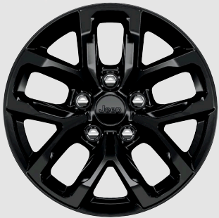
WFP - 17-inch Black Alloy Wheels (Standard on Night Eagle)

Option (O) Standard (S) Not Available (-) Not Available With (NAW)