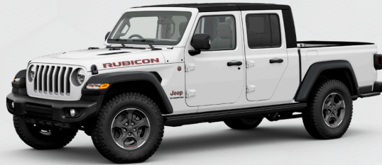
PW7 - Bright White (Standard)