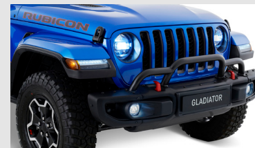
Collapsible Cargo Tote