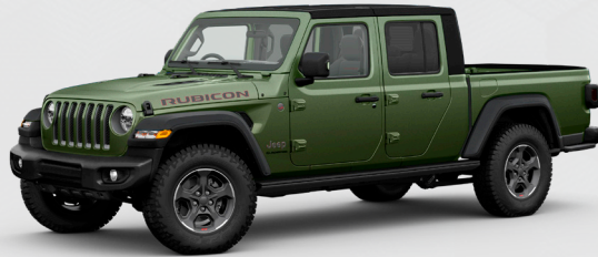
PGG - Sarge Green (Option)