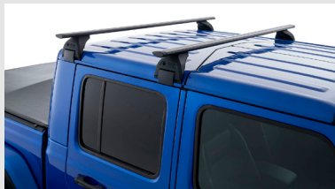
Moulded Cargo Tray

When it comes to your Jeep vehicle, not all parts are created equal. All Genuine Jeep accessories fitted at purchase are covered by the same 5-year/100,000km warranty* applied to your Jeep. This means you can personalise your vehicle with complete confidence.