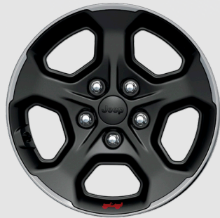
WFJ - 17-Inch Granite Crystal Alloy Wheels (Standard on Rubicon)