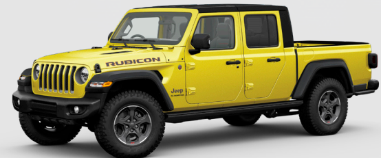
PJF - High Velocity (Option)