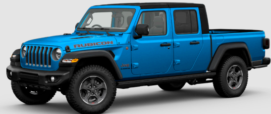
PBJ - Hydro Blue (Option)