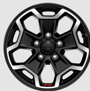
WFN - 17-inch Polished Black Alloy Wheels (Option on Rubicon)