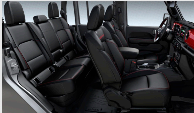
ALX9 - Black Leather Trimmed Bucket Seats (Option - Rubicon)