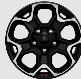
WGQ - 17-inch Machined Black Painted Wheels (Option on Rubicon - Late Availability)