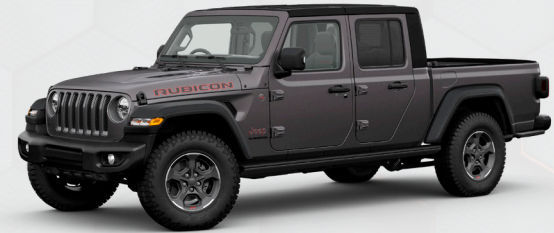
PAU - Granite Crystal (Option)