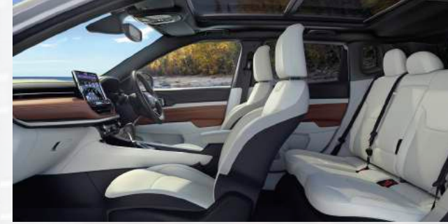
ALXA - Ski Grey Leather Seats with Ski Grey & Brown Interior and Grey Stitching (Optional - Limited)