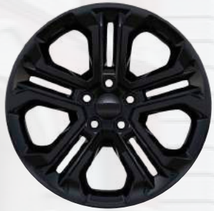
WBA - 18-inch Black Alloy Wheels (Standard on Night Eagle)

Option (O) Standard (S) Not Available (-) Not Available With (NAW)