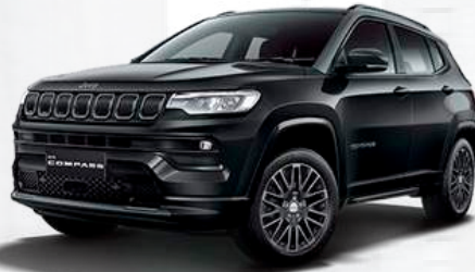
PXR - Brilliant Black (Option)