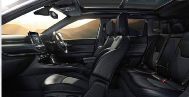
G7X9 - Black Cloth/Vinyl Seats with Black Interior (Standard Night Eagle)