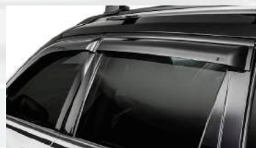
Side Window Air Deflector