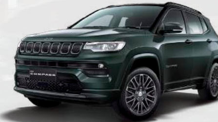
PGT - Hunter Green (Option)