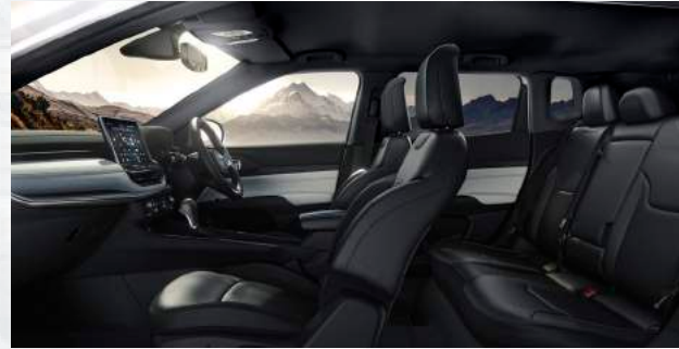
ALX9 - Black Leather Seats with Black and Ski Grey Interior and Grey Stitching (Standard - Limited)