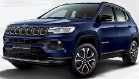
PHK - Galaxy Blue (Option)