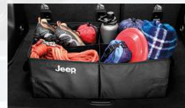
Collapsible Cargo Tote