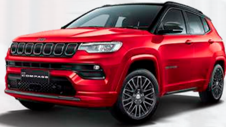
PRX - Colorado Red (Standard)