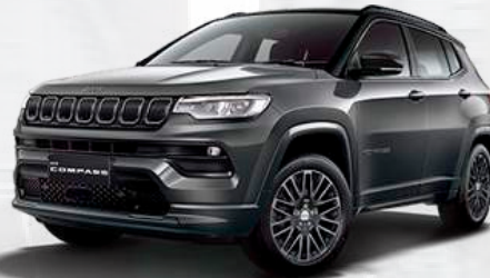
PNM - Grey Magnesio (Option)