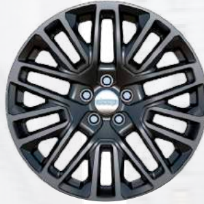
WCH - 19-inch Hyper Black Alloy Wheels (Standard on S-Limited)