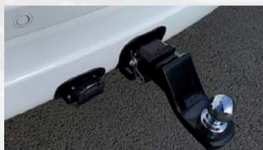
Tow Bar Kit