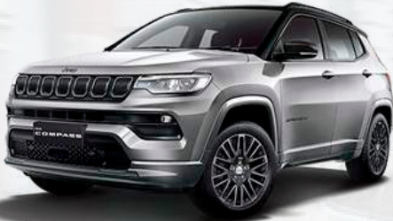
PS8 - Silvery Moon (Option)