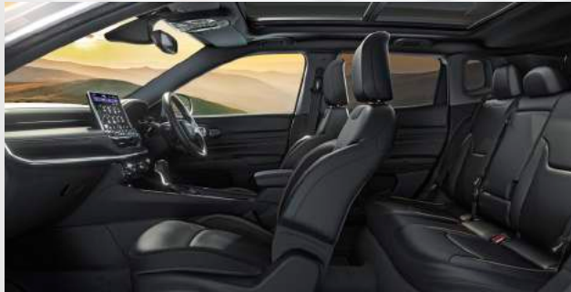
DLX9 - Black Leather Ventiladed Seats with Black Interior and Grey Stitching (Standard - S-Limited)