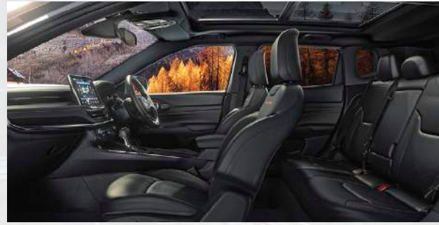
BLXC - Black Leather Ventiladed Seats with Black Interior and Red Stitching (Standard - Trailhawk)