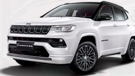
PW8 - Pearl White (Option)