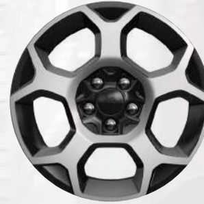
WFP - 17-inch Off-Road Alloy Wheels (Standard on Trailhawk)