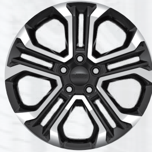
WP6 - 18-inch Alloy Wheels (Standard on Limited)