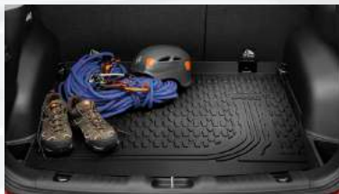
Moulded Cargo Tray

When it comes to your Jeep vehicle, not all parts are created equal. All Genuine Jeep accessories fitted at purchase are covered by the same 5-year/100,000km warranty* applied to your Jeep. This means you can personalise your vehicle with complete confidence.