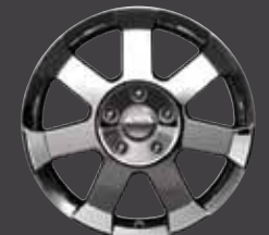
Chrome Cast-Aluminium Wheel 18-inch

07. SWING AWAY TYRE CARRIER. Moves the weight of the spare tyre from the body to the frame.