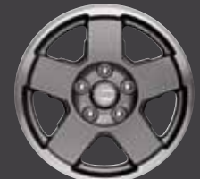
The Hulk Wheel 17-inch