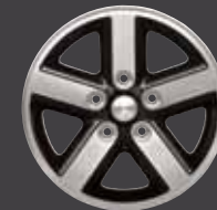
Black/Chrome Cast Aluminium Wheel 16-inch