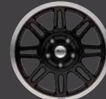
Black Painted Cast-Aluminium Wheel 17-inch