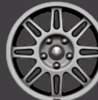
Black Pocketed Cast-Aluminium Wheel 17-inch