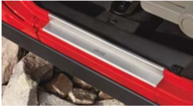
STAINLESS STEEL DOOR SILL GUARDS