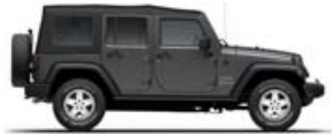
PAU - Granite Crystal (Option)