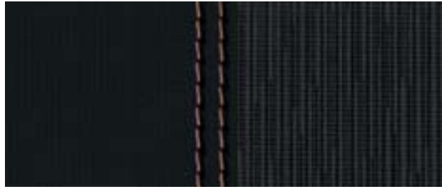
A7XV - Black Cloth with Tan Interior (No Cost Option - Rubicon)