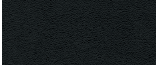
NLX9 - Black Moab Leather (Standard - Overland)