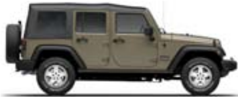
PUA - Gobi (Option)