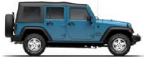
PQB - Chief (Option)