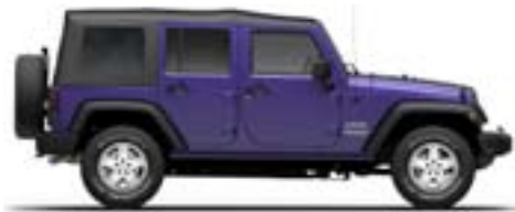
PHG - Xtreme Purple (Option)