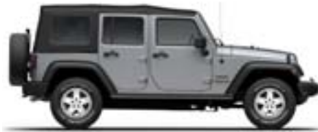
PSC - Billet Silver (Option)