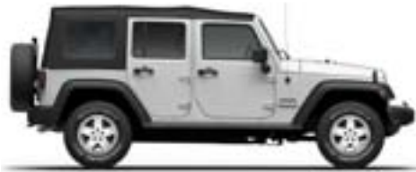
PW8 - Bright White (Standard)