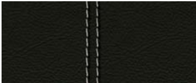
ALX9 - Black McKinley Leather (Option - Rubicon)