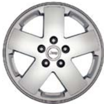
WK1 - 18-Inch 5-Spoke Alloy Wheel (Standard on Sport)