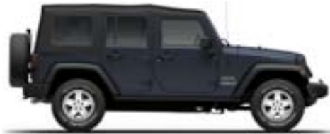
PSQ - Rhino (Option)