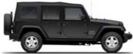
PX8 - Black (Standard)