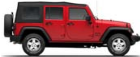
PRC - Firecracker Red (Option)