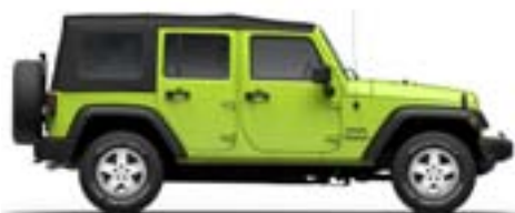
PJK - Hypergreen (Option - Limited Availability)