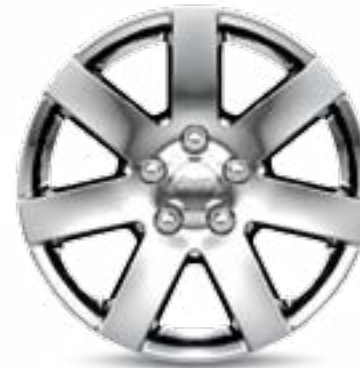
WPT - 18-Inch 7-Spoke Alloy Wheel (Option on Overland)