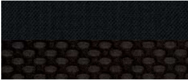
A7X9 - Black Cloth (Standard - Rubicon)