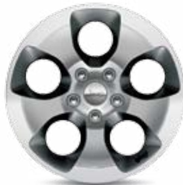
WFC - 18-Inch Alloy Wheel (Standard on Overland)