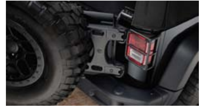
TAILGATE REINFORCEMENT ASSEMBLY