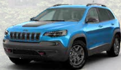
PBJ - Hydro Blue (Option)