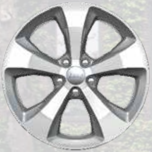
WPD - 18-Inch Satin Chrome Painted Alloy Wheels (Standard on Limited)

Option (O) Standard (S) Not Available (-) Not Available With (NAW)