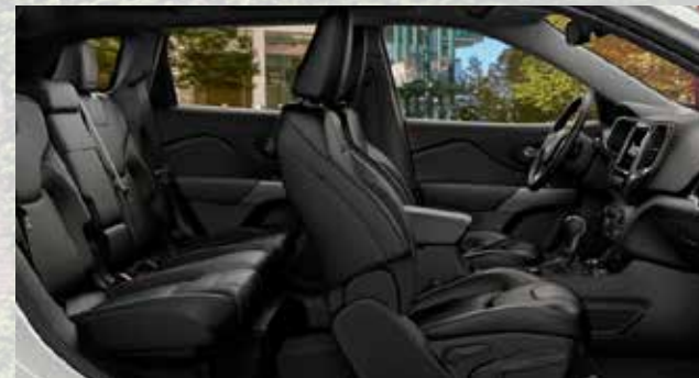
DLX9 - Black Leather with Tungsten Accent Stitch (Standard on S-Limited)