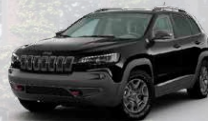
PXJ - Diamond Black (Option)