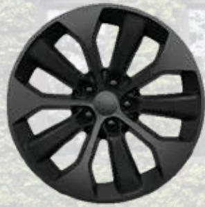
WPX - 19-Inch Granite Crystal Alloy Wheels (Standard on S-Limited)