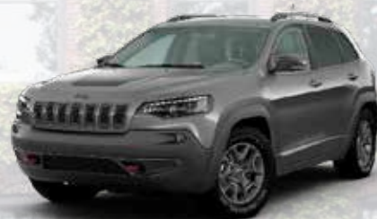
PSC - Billet Silver (Option)