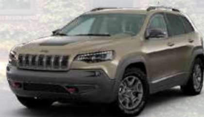
PT6 - Light Brownstone (Option)