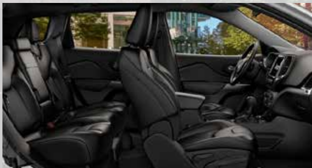
BLX9 - Black Leather with Red Accent Stitch (Standard on Trailhawk)