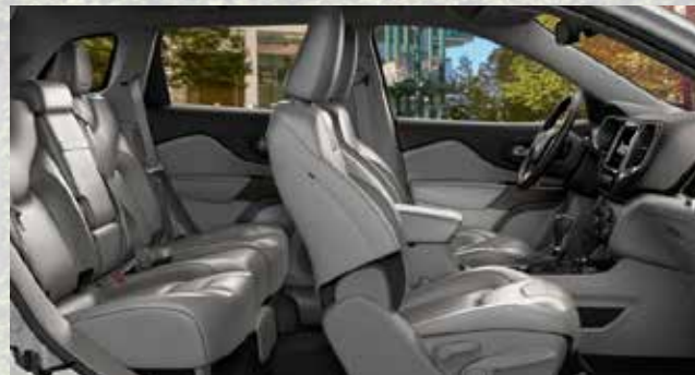
DLXS - Black & Ski Grey Leather (Option on Limited)