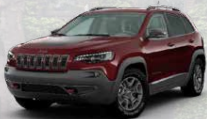
PRV - Velvet Red (Option)