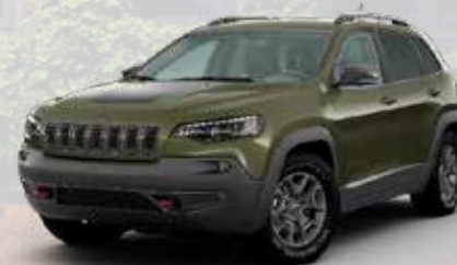
PFP - Olive Green (Option)