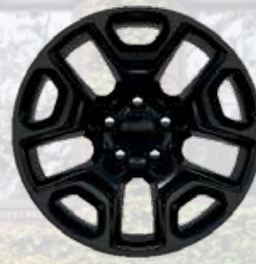
WBG - 17-Inch Black Painted Alloy Wheels (Standard on Trailhawk)