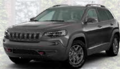
PAU - Granite Crystal (Option)