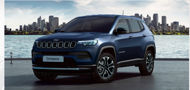
Blue Shade (PBF)