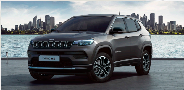
Graphite Grey (PSA)