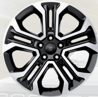
3DM - 18-Inch Diamond Cut Alloy Wheel (Standard on Limited)

Option (O) Standard (•) Not Available (-)