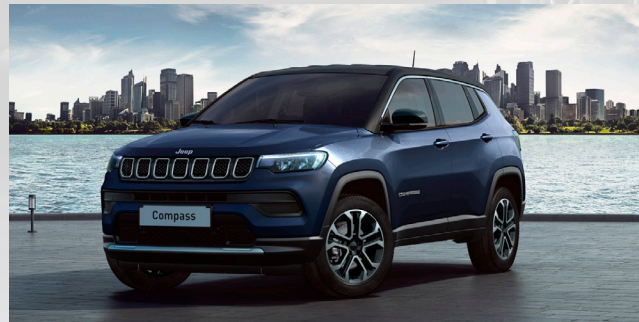
Blue Shade with Black Roof (PBF/MXS)