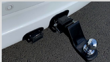
Tow Bar Kit