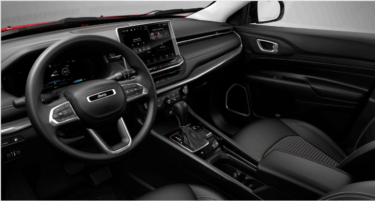
P7X7 - Black Interior with Leather Wrapped Steering Wheel (Standard - Limited)