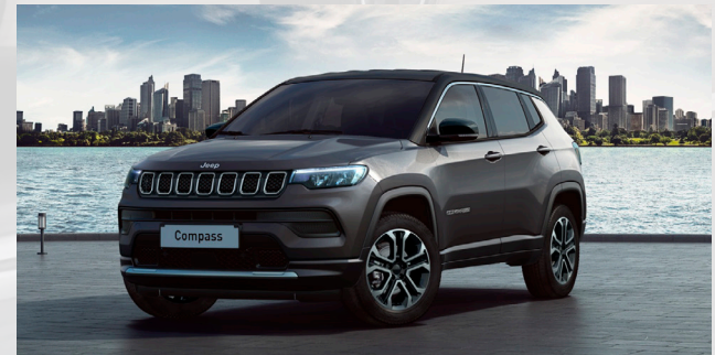
Graphite Grey with Black Roof (PSA/MXS)