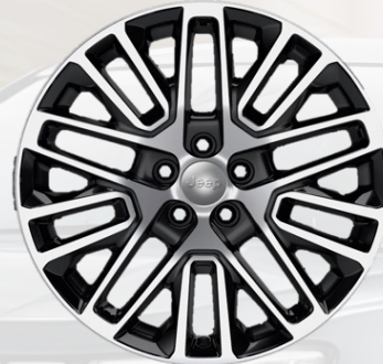
3DP - 19-Inch Diamond Cut Alloy Wheel (Standard on Summit)