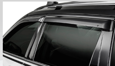
Side Window Air Deflector