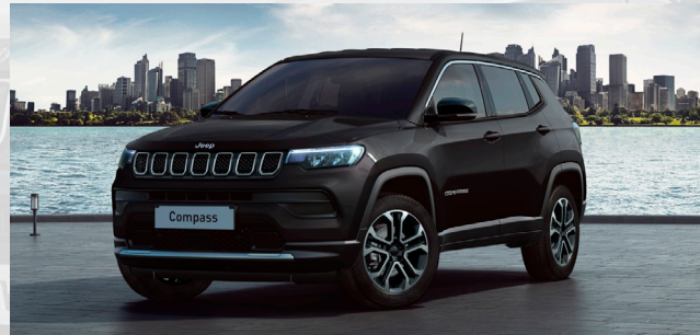
Solid Black (PX8)