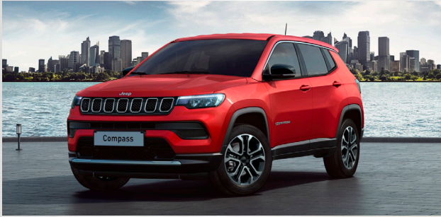
Colorado Red (PRX)