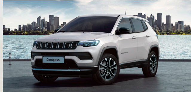
Alpine White (PWV)