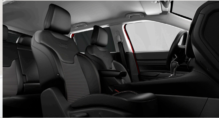
P7X7 - Black Cloth and TechnoLeather Seats with Diesel Grey Stitching (Standard - Limited)