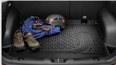
Moulded Cargo Tray

When it comes to your Jeep vehicle, not all parts are created equal. All Genuine Jeep accessories fitted at purchase are covered by the same 5-year/100,000km warranty* applied to your Jeep. This means you can personalise your vehicle with complete confidence.