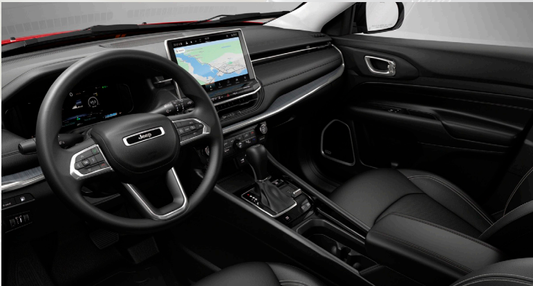
DLX7 - Black Accented Leather Interior with Leather Wrapped Steering Wheel (Standard - Summit)