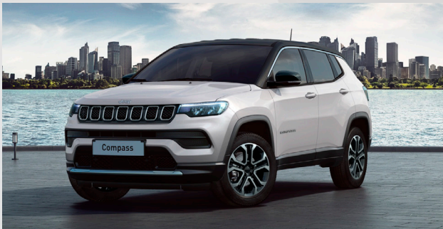
Alpine White with Black Roof (PWV/MXS)