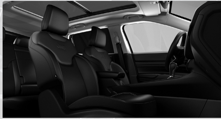
DLX7 - Black Leather Accented Seats with Diesel Grey Stitching (Standard - Summit)