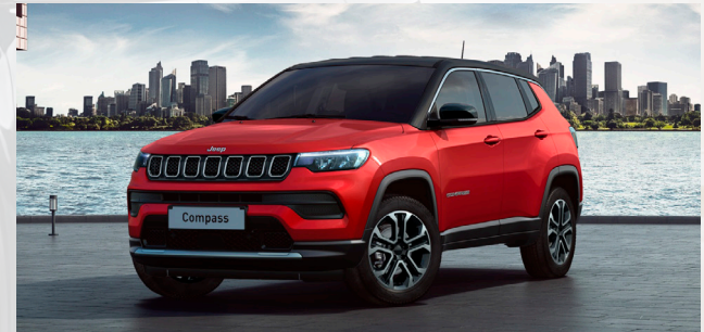
Colorado Red with Black Roof (PRX/MXS)