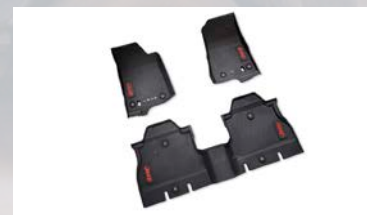
All Weather Mats

*Which occurs first. ^Please see Jeep.com.au ~When you service with Jeep