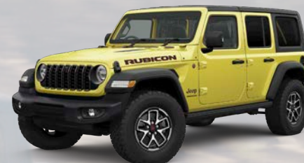
PJF - High Velocity (Option)