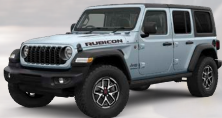
PGP - Earl (Option)