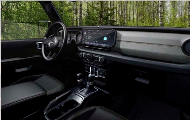
E7X9 - Black Cloth (Standard - Sport S)

Option (O) Standard (S) Not Available (-)