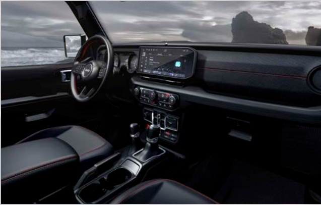
VLX9 - Black Nappa Leather Trimmed Bucket Seats (Standard - Rubicon)