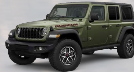
PGG - Sarge (Option)