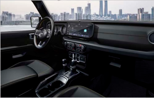
BPX9/NLX9 - Black McKinley Premium (Standard - Overland)