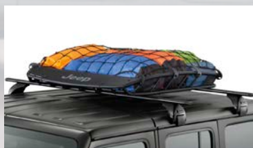
Roof Rack Kit