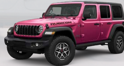
PHP - Tuscadero (Option) From March 2024 production