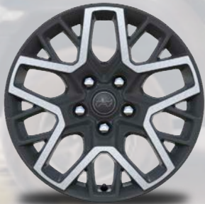
WPA 18-Inch Machined Painted Grey Wheels (Standard on Overland)