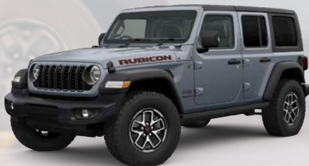
PDS - Anvil (Option)