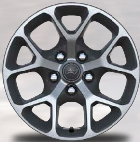
WFH 17-Inch Machined Wheels with Black Pockets (Standard on Sport S)