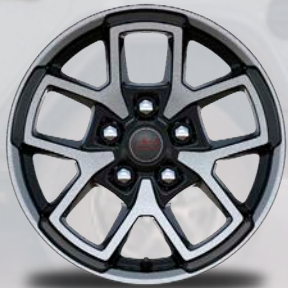
WFV 17-Inch Machined Painted Black Wheels (Standard on Rubicon)