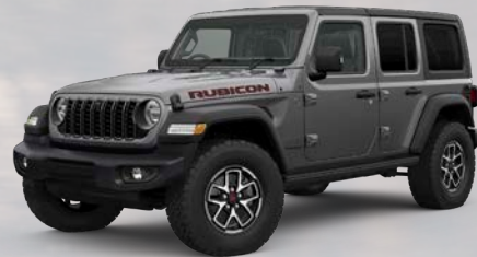
PAU - Granite Crystal (Option)