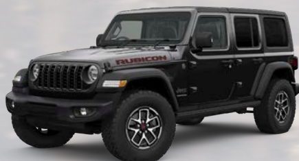
PX8 - Black (Option)