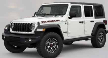
PW7 - Bright White (Standard)