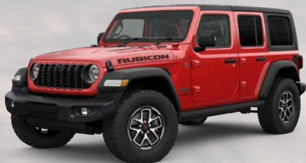
PRC - Firecracker Red (Option)