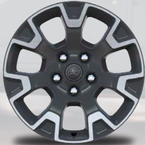
WPD 18-Inch Machined Painted Grey Wheels (Optional on Overland) (Available until March 2024 production)