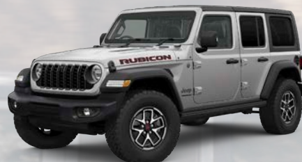
PSE - Silver Zynith (Option)