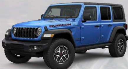
PBJ - Hydro Blue (Option)