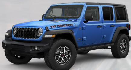
PBJ - Hydro Blue (Option)