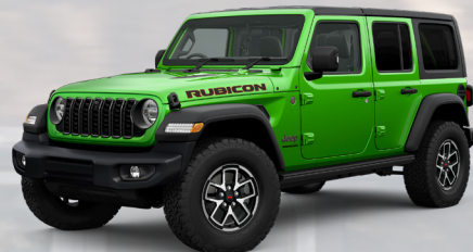
PGE - Mojito (Option)