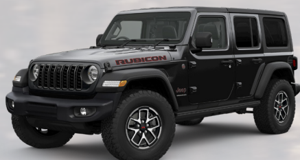
PX8 - Black (Option)