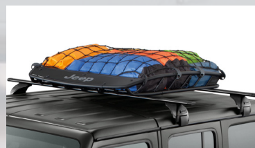
Roof Rack Kit