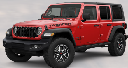
PRC - Firecracker Red (Option)