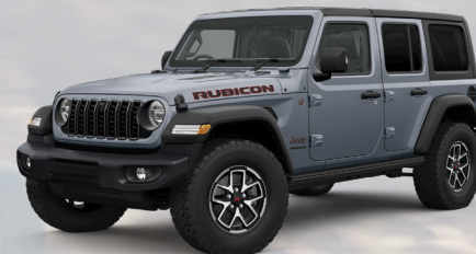
PDS - Anvil (Option)