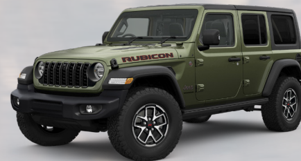
PJ5 - 41 (Option)