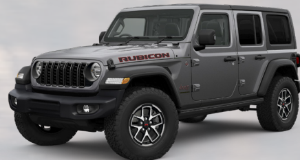
PAU - Granite Crystal (Option)