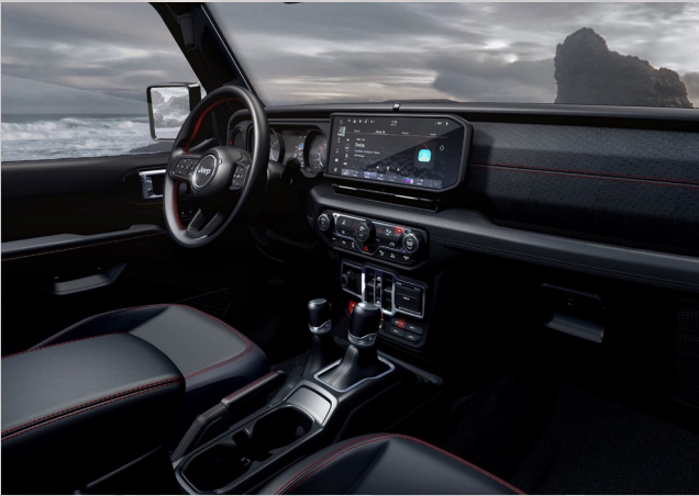
VLX9 - Black Nappa Leather Trimmed Bucket Seats (Standard - Rubicon)

Option (O) Standard (S) Not Available (-)