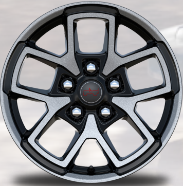
WFV - 17-Inch Machined Painted Black Wheels (Standard on Rubicon)