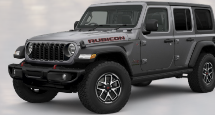
PAU - Granite