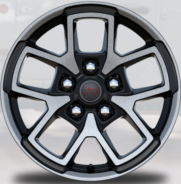
WFV - 17-Inch Machined Painted Black Wheels (Standard on Rubicon)