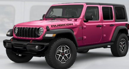
PHP - Tuscadereo April 2026 - July 2026 production