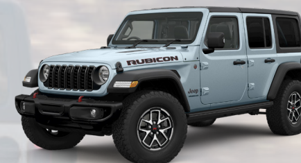
PGP - Earl April 2026 start of production