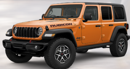
PL4 - Joose April 2026 start of production