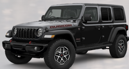
PX8 - Black