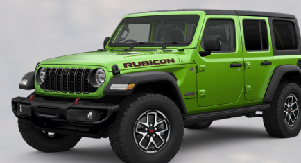
PGE - Mojito June 2026 end of production