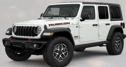
PW7 - Bright White