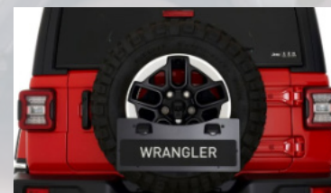
Towbar Licence Plate Relocation Kit