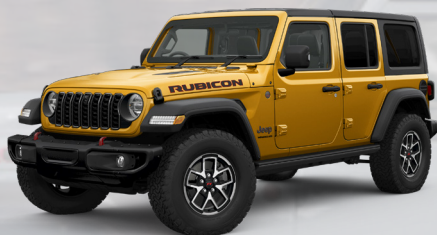
PYC - Goldilocks April 2026 - June 2026 production