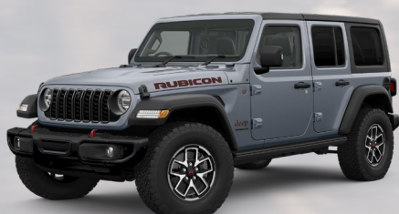
PDS - Anvil June 2026 end of production