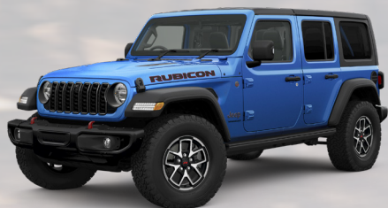
PBJ - Hydro Blue