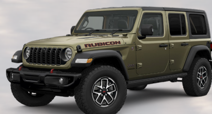
PJ5 - '41