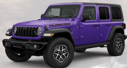
PHT - Reign Sept 2025 - April 2026 production