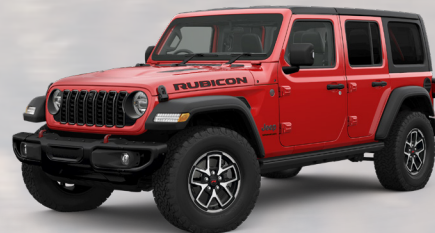
PRC - Firecracker Red