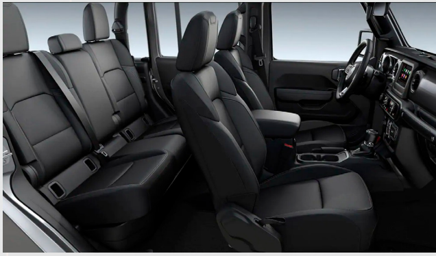
A7X9 - Black with Peak Embossing and Black Stitching (Standard - Night Eagle)