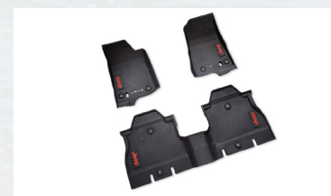
All Weather Mats

*Which occurs first. ^Please see Jeep.com.au ~When you service with Jeep