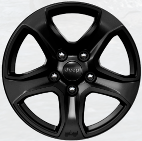
17-Inch Painted Black Alloy Wheels (Standard on Night Eagle)