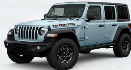
PGP - Earl (Option)