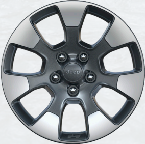
WGB - 18-Inch Tech Gray Diamond Cut Wheels (Standard on Overland)