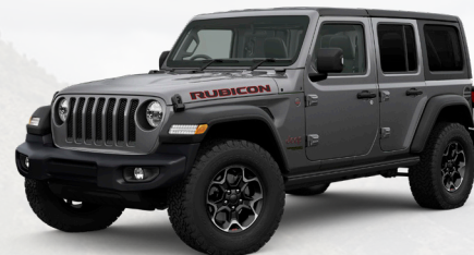
PAU - Granite Crystal (Option)