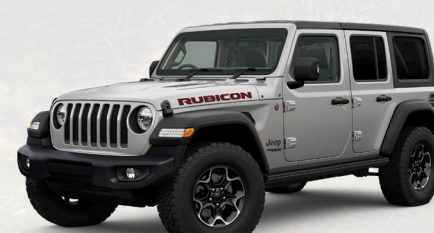
PSE - Silver Zynith (Option)