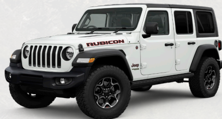
PW7 - Bright White (Standard)