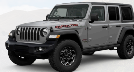
PDN - Sting Grey (Option)