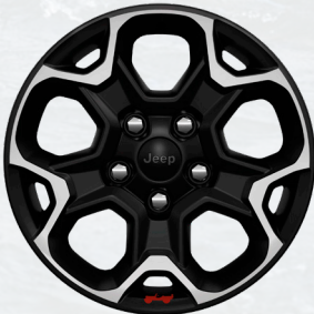
WGQ - 17-Inch Machined Black Painted Wheels (Standard on Rubicon)