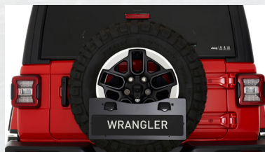
Licence Plate Holder

When it comes to your Jeep vehicle, not all parts are created equal. All Genuine Jeep accessories fitted at purchase are covered by the same 5-year/100,000km warranty* applied to your Jeep. This means you can personalise your vehicle with complete confidence.