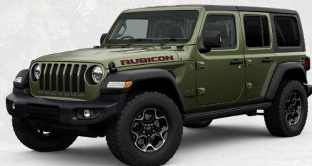
PGG - Sarge (Option)