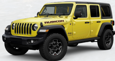
PJF - High Velocity (Option)