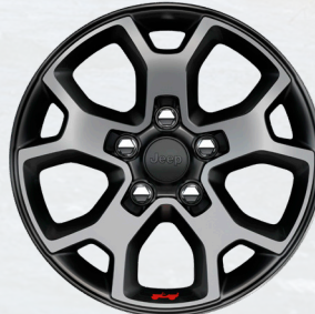
WGM - 17-Inch Polished Wheels with Black Pockets (Optional on Rubicon)