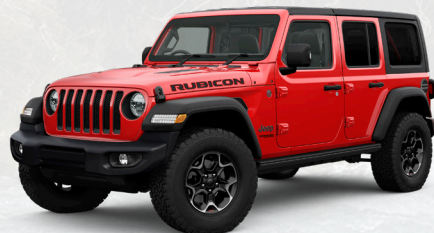
PRC - Firecracker Red (Option)