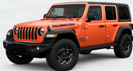
PE4 - High Punk'n (Option)