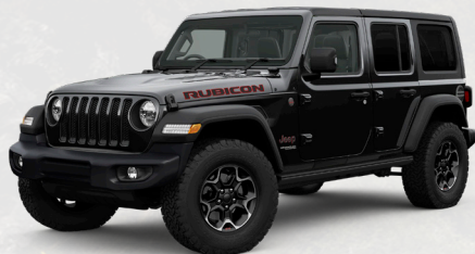
PX8 - Black (Standard)