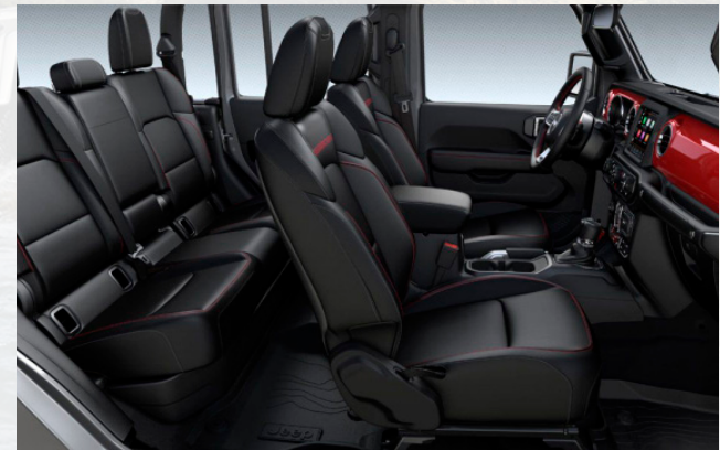
ALX9 - Black Leather Trimmed Bucket Seat (Standard - Rubicon)