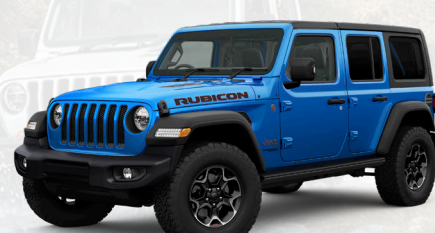
PBJ - Hydro Blue (Option)