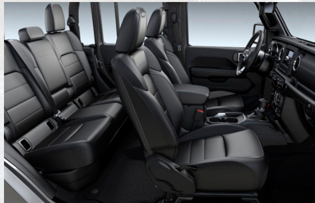
MLX9 - Black McKinley Leather with Overland Logo (Standard - Overland)