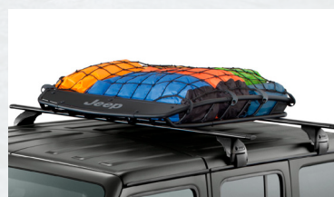
Roof Rack Kit